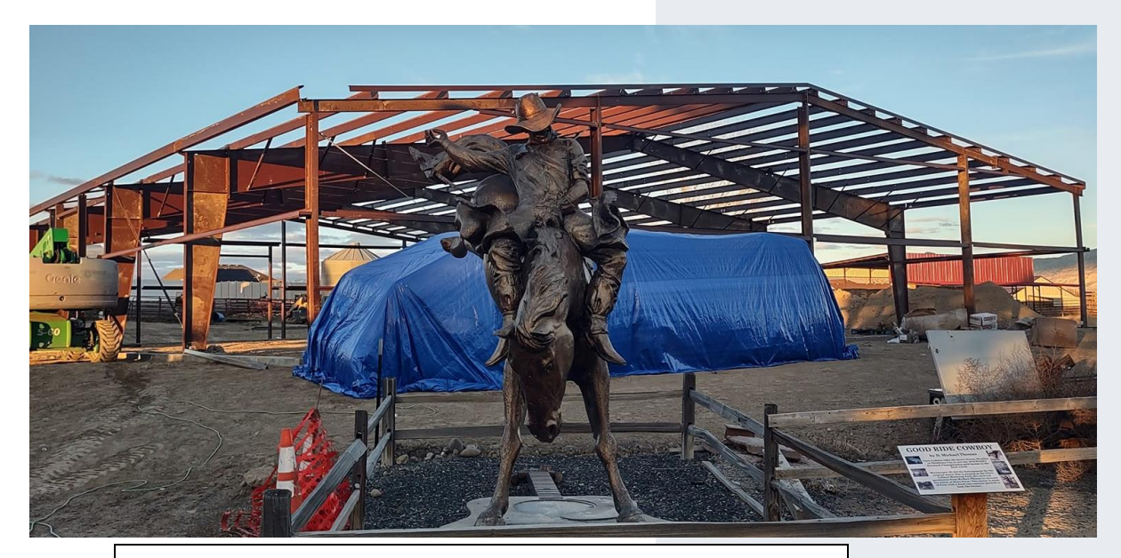
Construction progress on our indoor arena